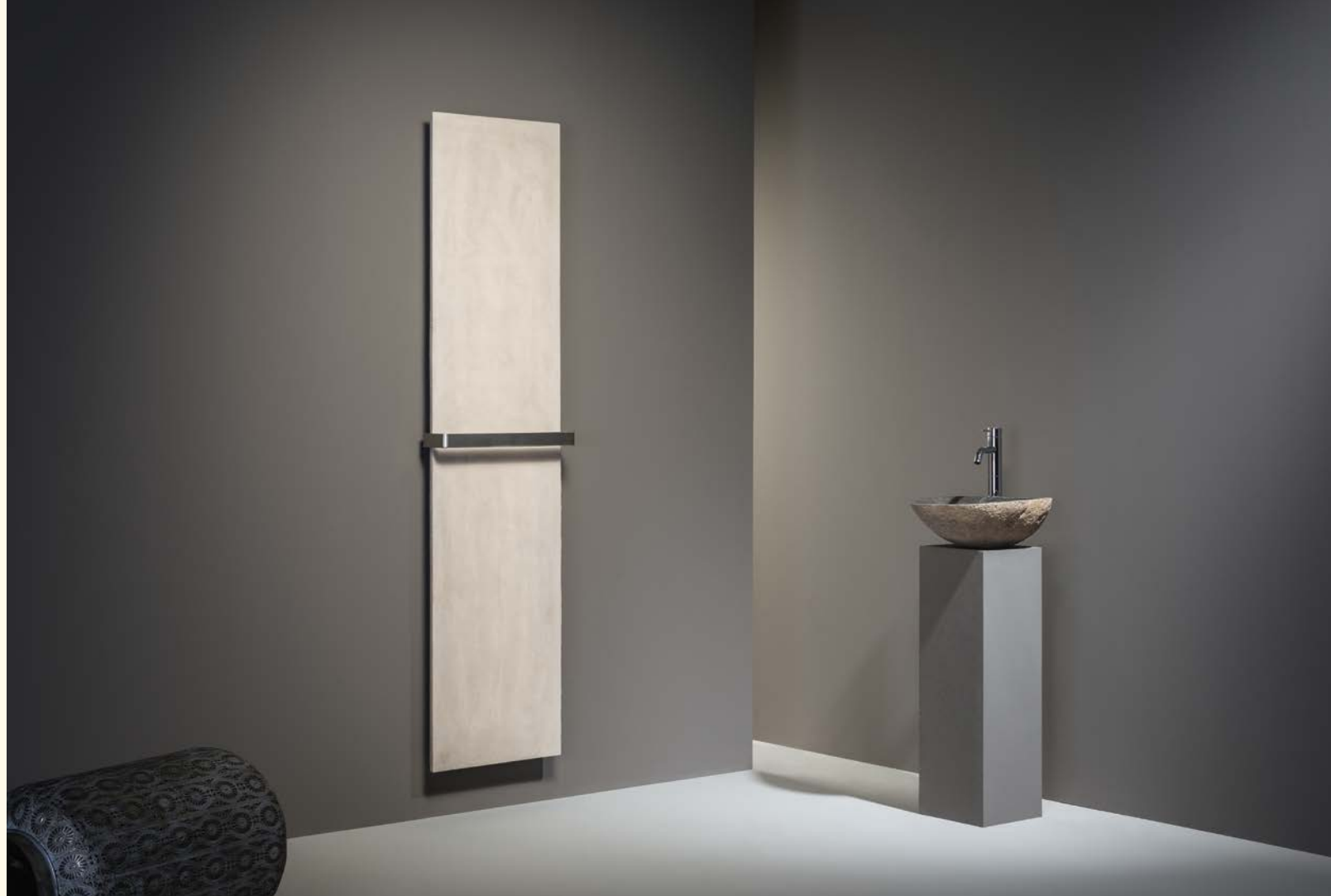
4118: Pure Art Three Glaze: granite 2 light with Weathered pattern

Pure Art by Sommerhuber offers you a variety of creative opportunities. You choose a glaze color, surface and structure and thus compose your individually manufactured unique piece – your original by Sommerhuber. Pure Art with its gentle ceramic infrared warmth – an exceptional visible and tangible experience.