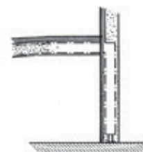
Lower section inserted into wall