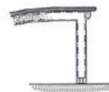
Lower section freestanding